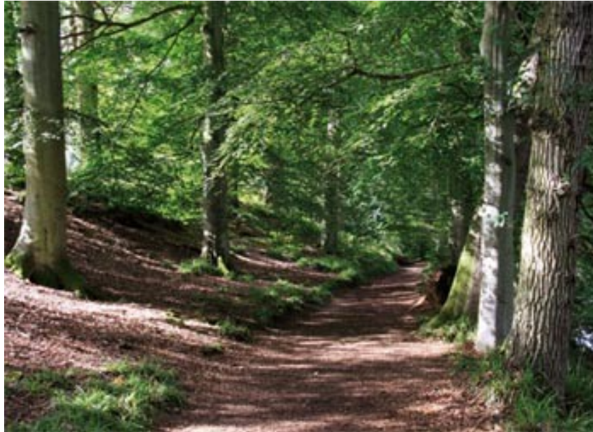
The tree-lined path beside the River Eden on the edge of Armathwaite.