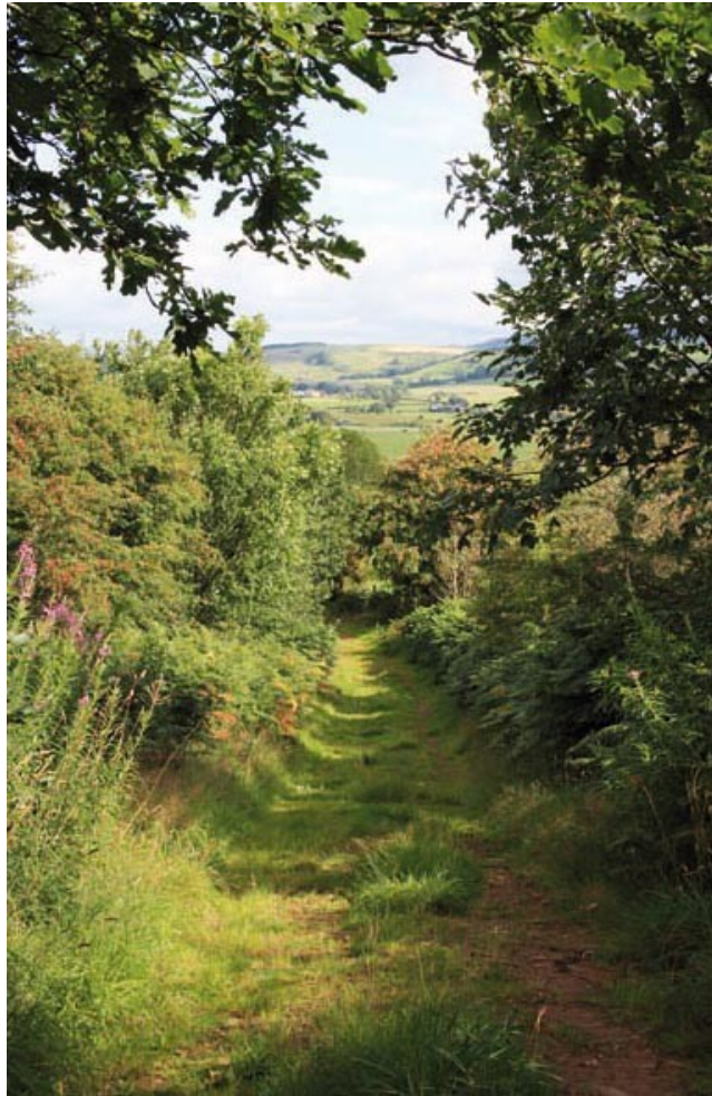
The track heading north from Longdales.

Far below, the River Eden has carved a beautiful valley the graceful curvy sides of which are covered in wood-land and rolling farmland. Beyond the metal gate, turn left along the road and then take the next road on your right. Immediately after passing the cottages in Longdales , turn left along a track. This climbs to a high point of about 170m, from where you get a superb view of the rolling farmland to the north and the Pennines to the east. Those views stay with you as you continue straight ahead between hedgerows. Turn left along the road. Follow it back across the River Eden and then retrace your steps into Armathwaite .